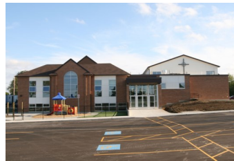
Welcoming our friends and neighbours to fellowship .

port what they thought was a great idea for the Oakridge community. Praise God.