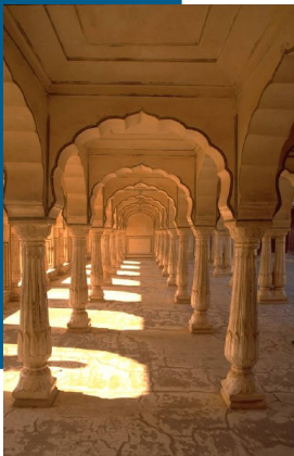
Growing in faith at OPC

Bible Study: Beginning on Tuesday, September 12 at 9:30 in the Upper Room, we will continue our study with chapter 5 of Ephesians. Everyone is welcome.