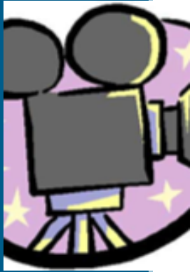
Faith at the Flicks: movies & fellowship