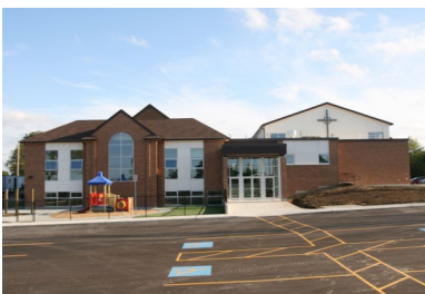
OPC to host Canada Youth, 2016 Primo Promo

The tenth annual junior youth event, One Day Wonder , hap-